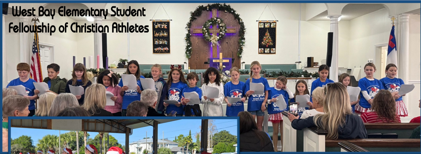
West Bay Elementary Student Fellowship of Christian Athletes