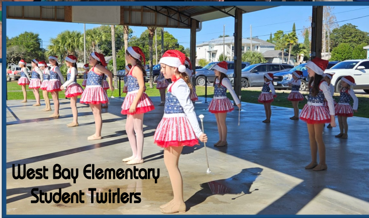
West Bay Elementary Student Twirlers