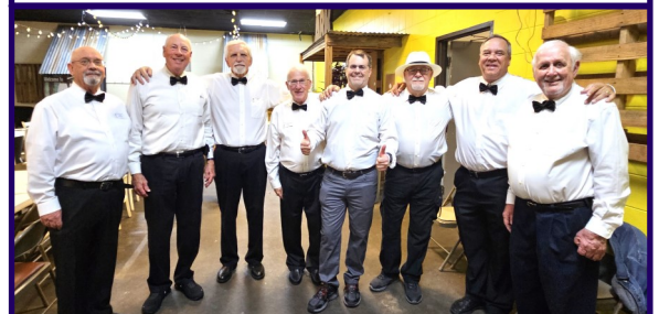
Some of the Gulfview Servers in March

Would you like to be blessed? Come serve and help prepare dinner at The Ark. Gulfview wants to help with the Tuesday, Dec. 3 dinner at 6 p.m.